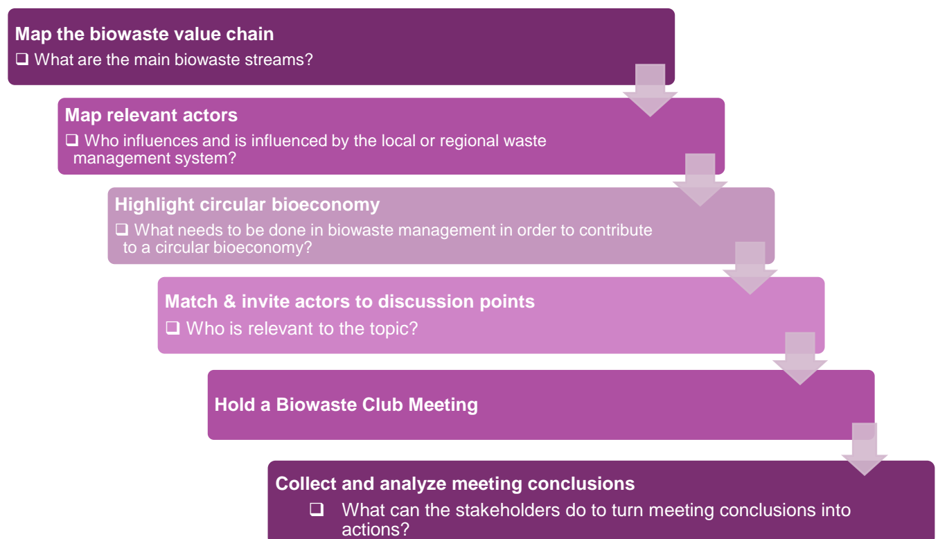
Figure 2. Process of organizing Biowaste Club Meetings 3

In the Biowaste Club meetings in these Lighthouses, stakeholders engaged represented, for instance, non-governmental organizations, research and development organizations, business (medium- to small-scale): SMEs and/or local business owners, local public bodies (e.g. city council or municipality) and service providers with a focus on waste e.g. waste collectors, treatment plants, waste management. Subsequent Biowaste Club meetings will be based on the discussion results of the meetings carried out in the first reporting period, the tailor-made stakeholder engagement plan for each LH, or will be planned to involve other stakeholders, such as members of the HOOP Network, that are considered to be essential to ensure HOOP leverage. The process of organizing a Biowaste Club meeting is summarised in Figure 2.