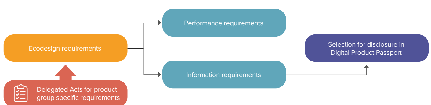
Figure 3: Requirements envisaged in the Ecodesign for Sustainable Products Regulation proposal<sup>48</sup>

The EU Strategy for Sustainable and Circular Textiles aims that by 2030 textile products placed on the EU market will be long-life and recyclable. They will be made as much as possible from recycled fibres, free of hazardous substances and produced respecting social rights and the environment. Measures include specific ecodesign requirements for textiles to minimise overall carbon and environmental footprints, an extended mandatory producer responsibility scheme, more user-oriented information and a DPP. Combined, these measures will ensure the accuracy of 'green' claims and provide a boost for circular business models through reuse and repair services. Thereby, a DPP will be at the centre of the twin transition of circularity and digitalisation in the textile sector.