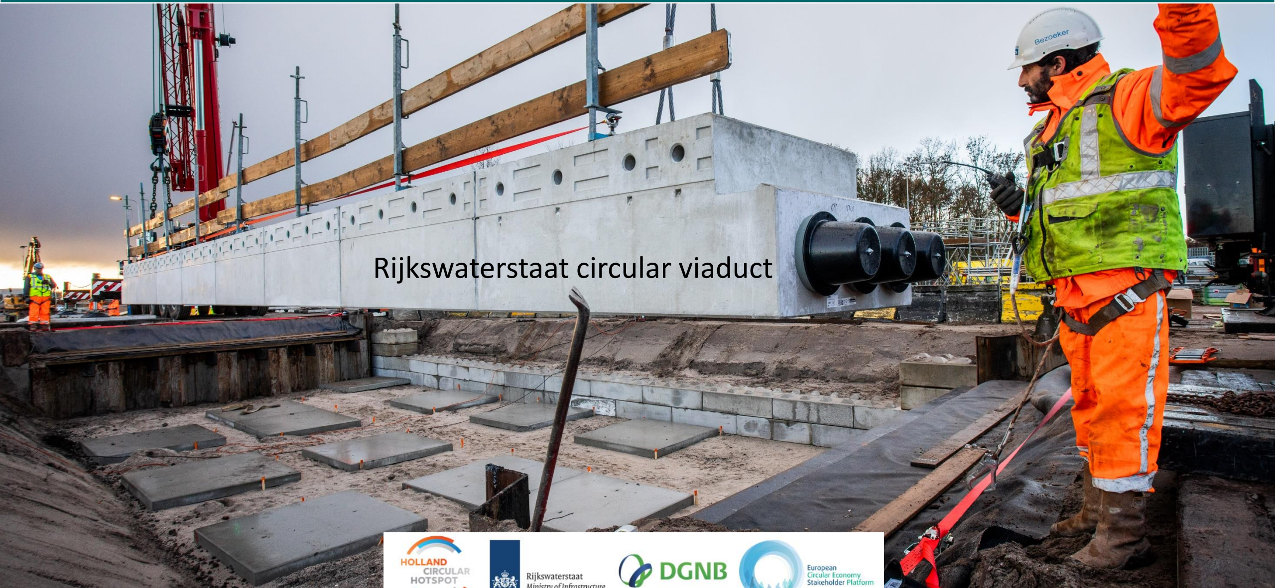
Rijkswaterstaat circular viaduct